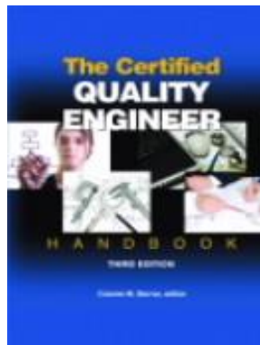
The ASQ Certified Quality Engineer Handbook 3 rd . Edition (e-book) Normal Price USD161/=.